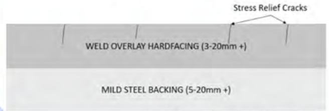
Cross Section of AbrasaPlate

AbrasaPlate® is a highly wear resistant chromium carbide weld overlayed onto a mild steel backing. It provides excellent solutions to wear areas subject to low and high stress abrasion. The High level of Chrome in the overlay ensures a corrosion resistant deposit which polishes to a high finish in service.