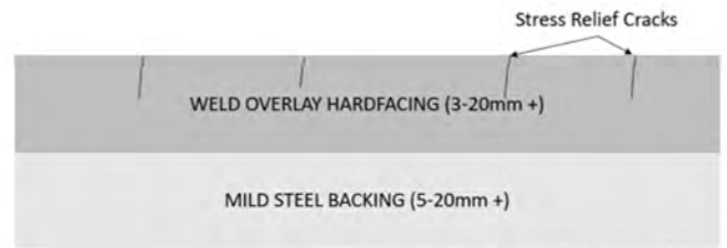
Cross Section of AbrasaPlate